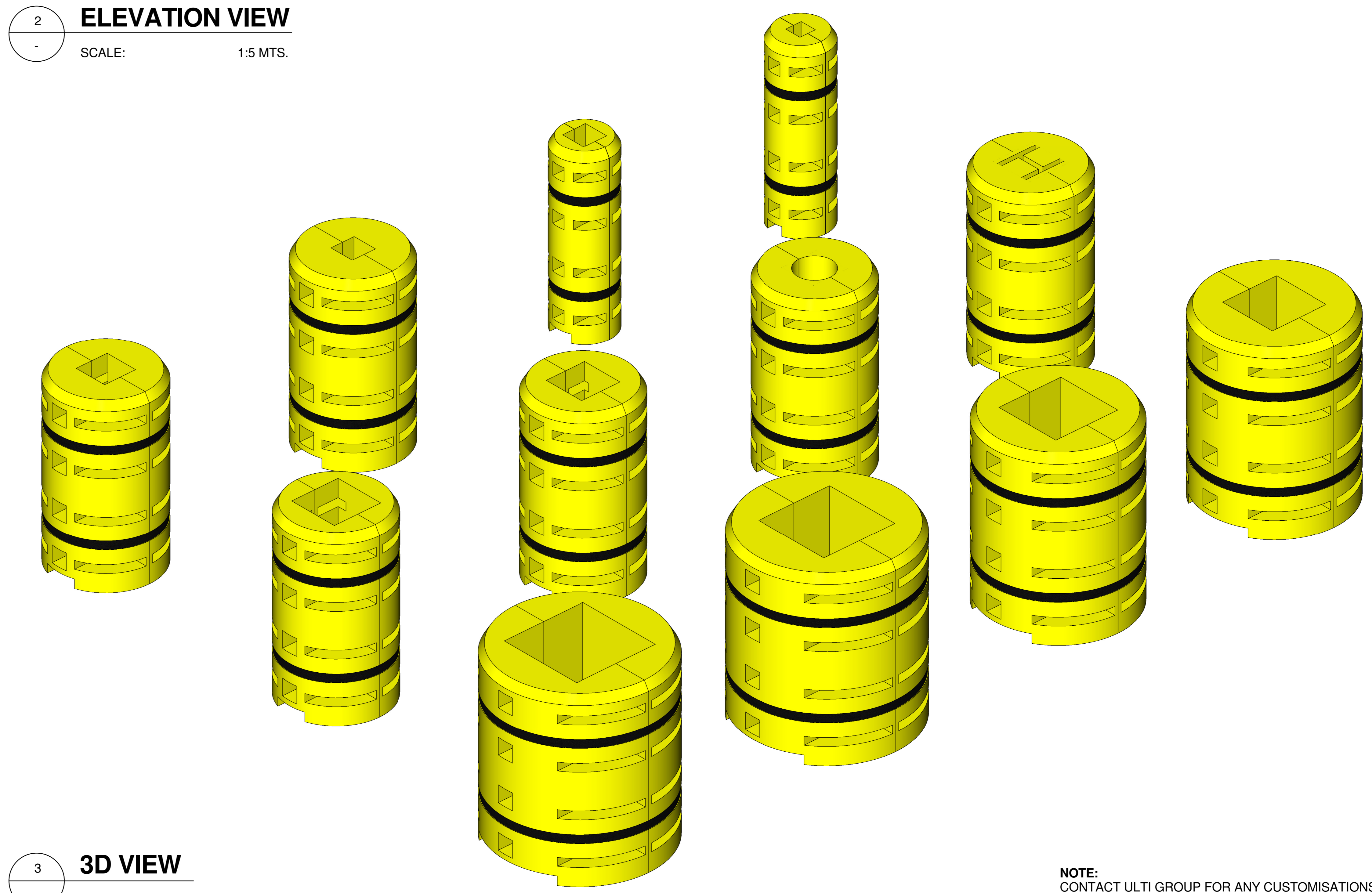
3 3D VIEW SCALE: N.T.S.

NOTE: CONTACT ULTI GROUP FOR ANY CUSTOMISATIONS AND TO DISCUSS PROJECT SPECIFIC INFORMATION