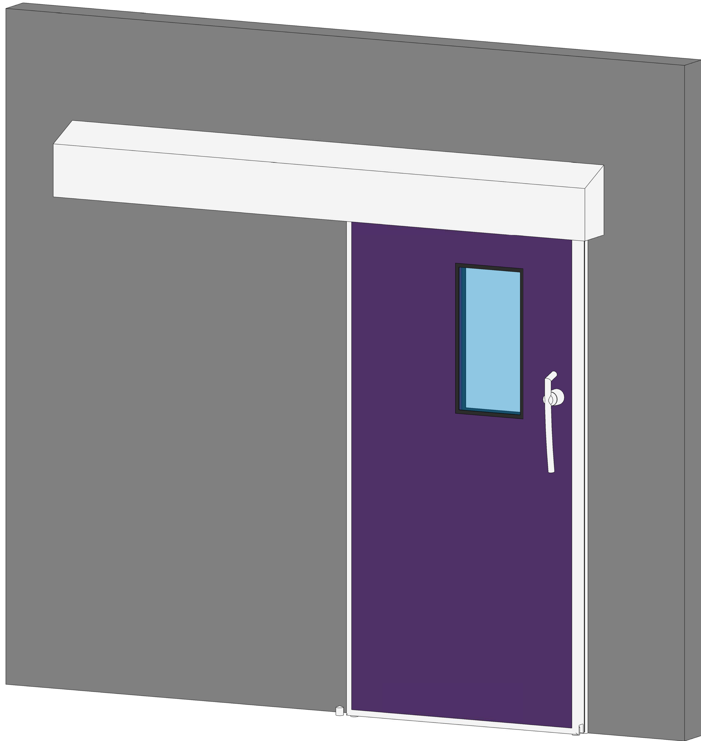
3 3D VIEW

NOTE: CONTACT ULTI GROUP FOR ANY CUSTOMISATIONS AND TO DISCUSS PROJECT SPECIFIC INFORMATION